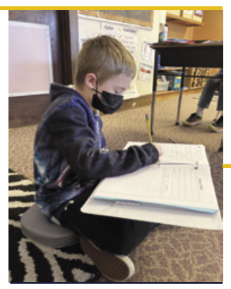
Flexible seating options provide students the ability to better focus on instruction