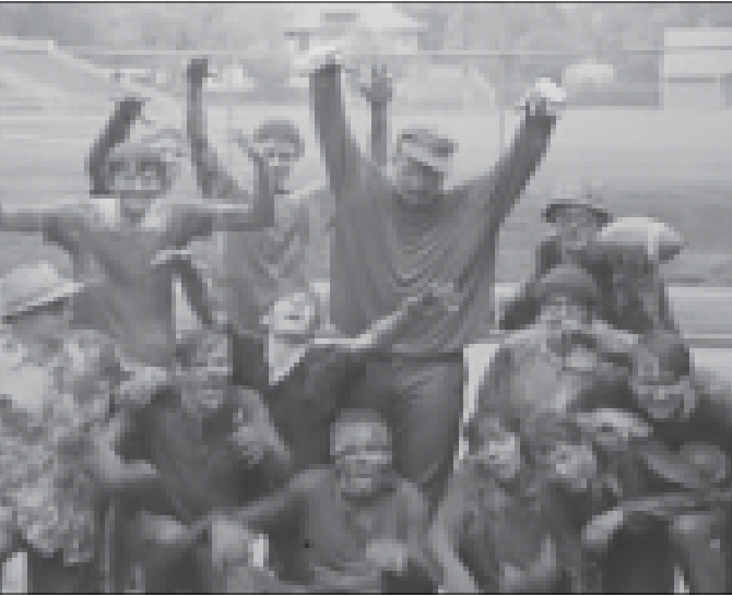
Our group of friends who played Saturday flag football all during the fall of 1968-1969. We called ourselves the Glorystompers. Obviously, this picture was taken after a very muddy day of fun.