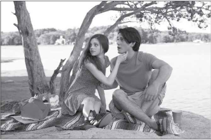
Tillie (India Eisley) and Niko (KJ Apa) at Altar Rock

Altar Rock is a tense, thrilling feature film that took three years to come to fruition. My lack of experience slowed the process down but if I’d known all the roadblocks I wouldn’t have even started. My two lead actors, KJ Apa (best known as Archie on Riverdale ) and India Eisley (Ashley in The Secret Life of the American Teenager ) have become stars since I hired them three years ago. That may or may not help me sell the film. Was it worth it? I’ll tell you after it’s sold but it was the hardest thing I’ve ever done. What did I learn? The film business from start to finish! This is one tough business. My next project will be easier.